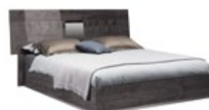
Q.S./UK 5" BED PJHE0150

inch W 64" D 18" H 18" cm L 162 P 45 H 45 Crts 1 kg 40 m 3 0,44