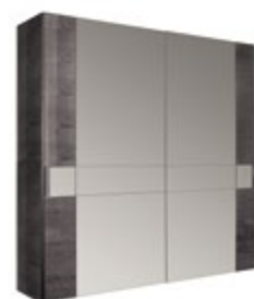
2/D SLIDING WARDROBE

Inner size inch 71" x 80" - cm 180,5 x 200,5 inch W 84" D 85" H 49" cm L 213 P 215,3 H 123,8 Crts 3 kg 102 m 3 0,36