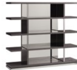
BOOKCASE PJHE0631 With drawer inch W 63" D 15" H 56" cm L 160 P 38 H 143,3 Crts 2 kg 144 m 3 0,69

With vanilla elm structure, seat and back in ecoleather inch W 20" D 24" H 43" cm L 50 P 60 H 108 Crts 1 kg 10 m 3 0,40