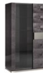
2/D CURIO PJHE600 With glass doors

inch W 25" D 21" H 75" cm L 64,5 P 52,7 H 190,4 Crts 2 kg 98 m 3 0,83