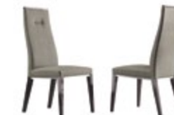
2 CHAIRS KJHE620 2 CHAIRS (UK FIRE RETARDANT) KJHE6201

inch W 52" D 1" H 38" cm L 132 P 2,2 H 96 Crts 1 kg 26 m 3 0,14